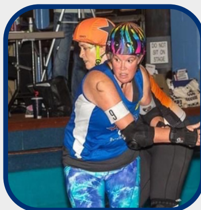
MELANIE TUCK PUBLIC RELATIONS